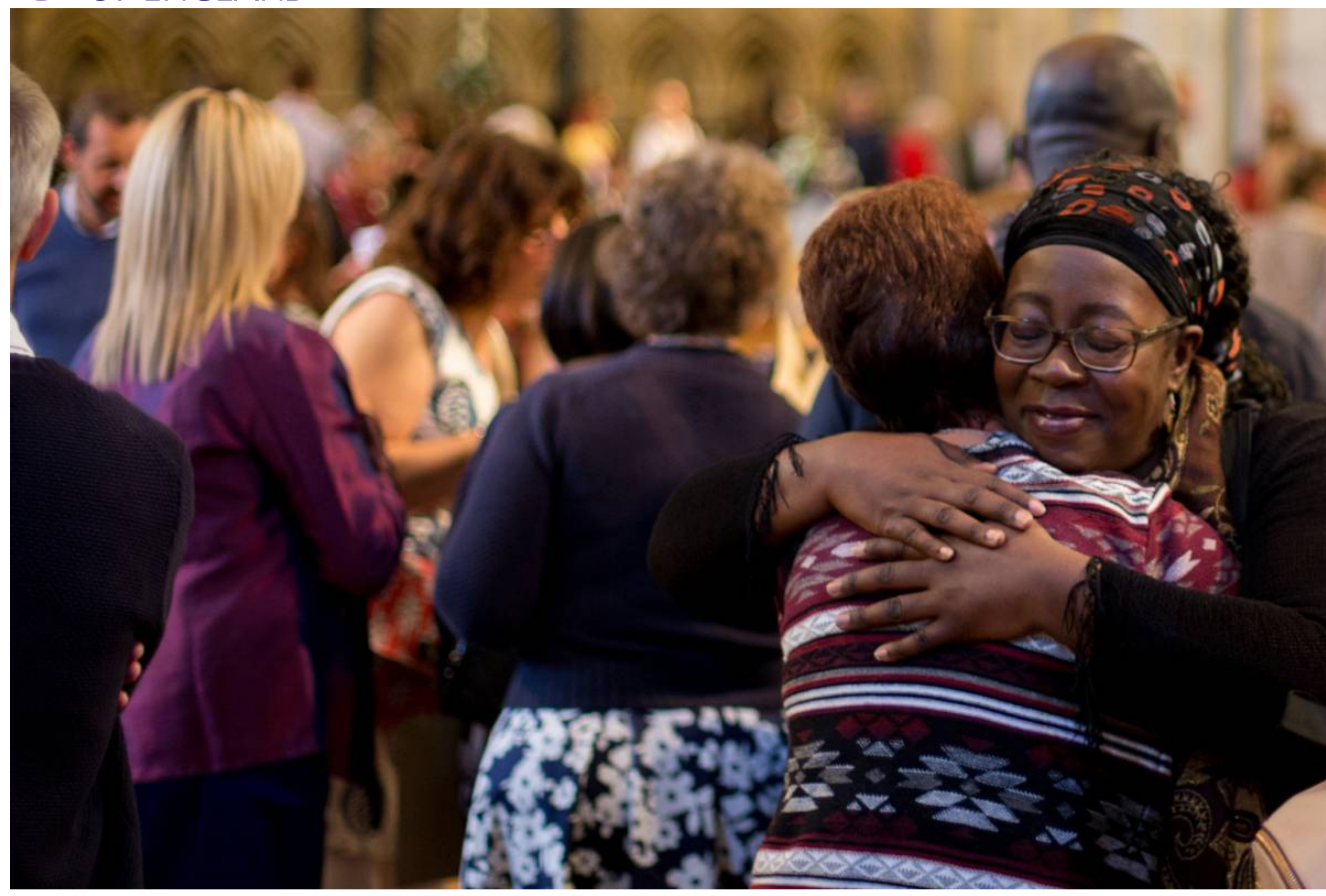
Diocese of Southwark

Supporting the Church of England now and for the long term