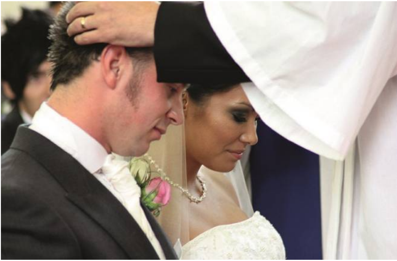
Seven steps to a heavenly wedding