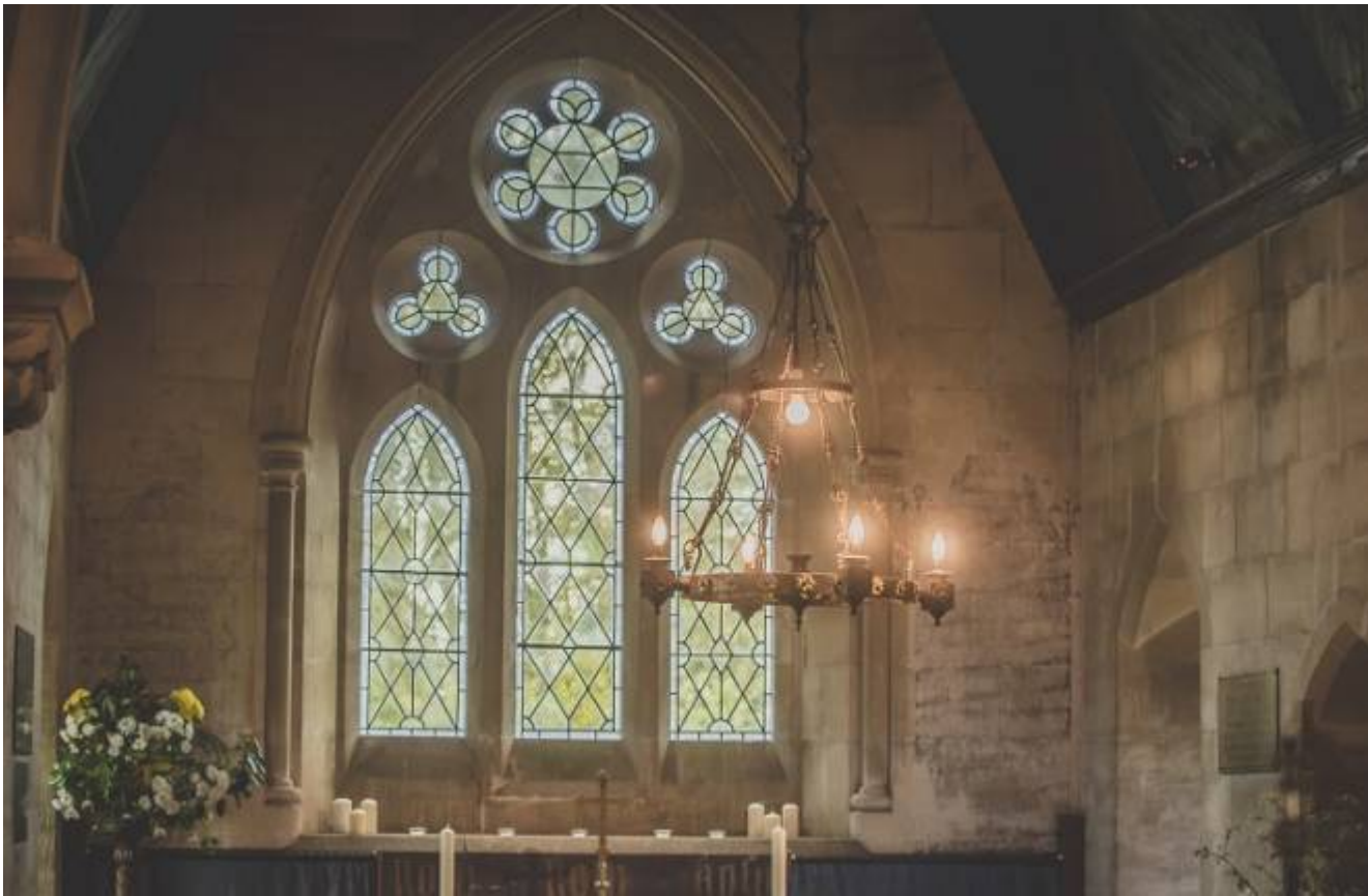
Marriage after divorce