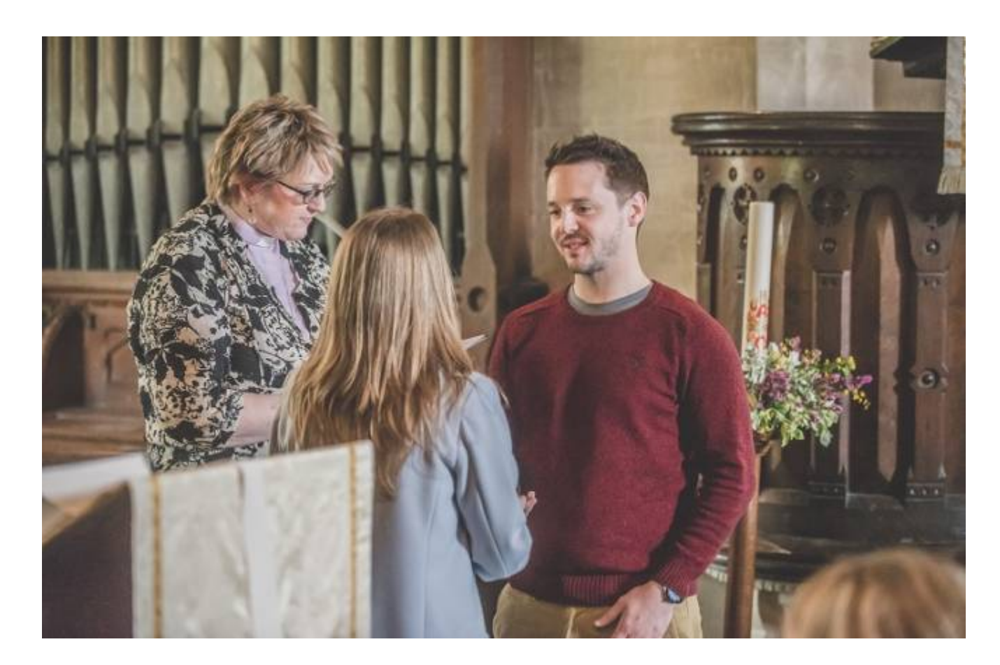
Preparing for marriage