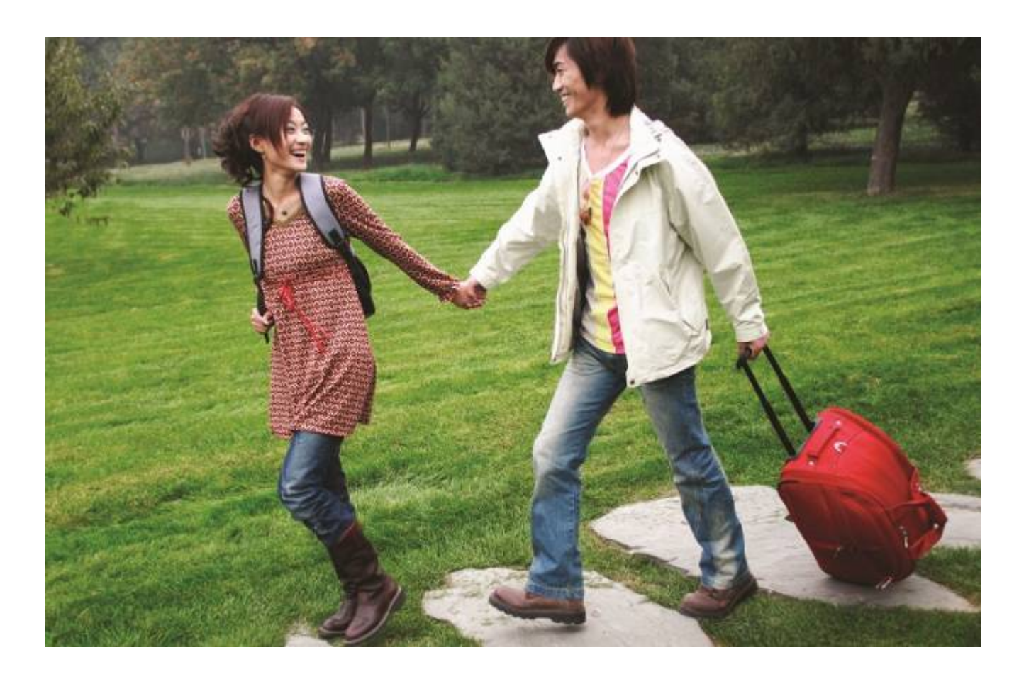
The good times