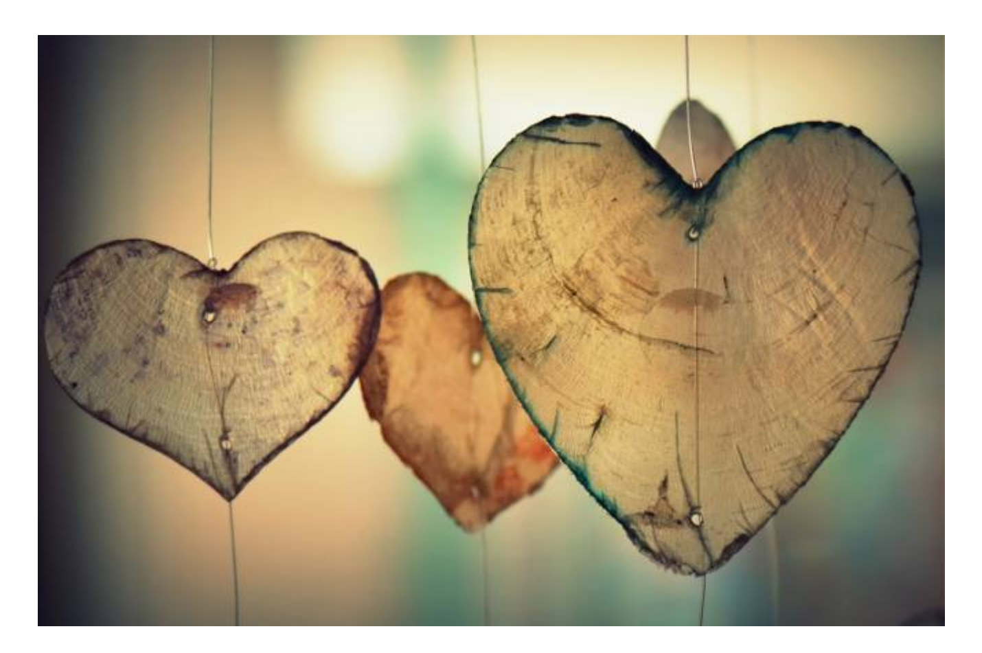
Thinking about marriage