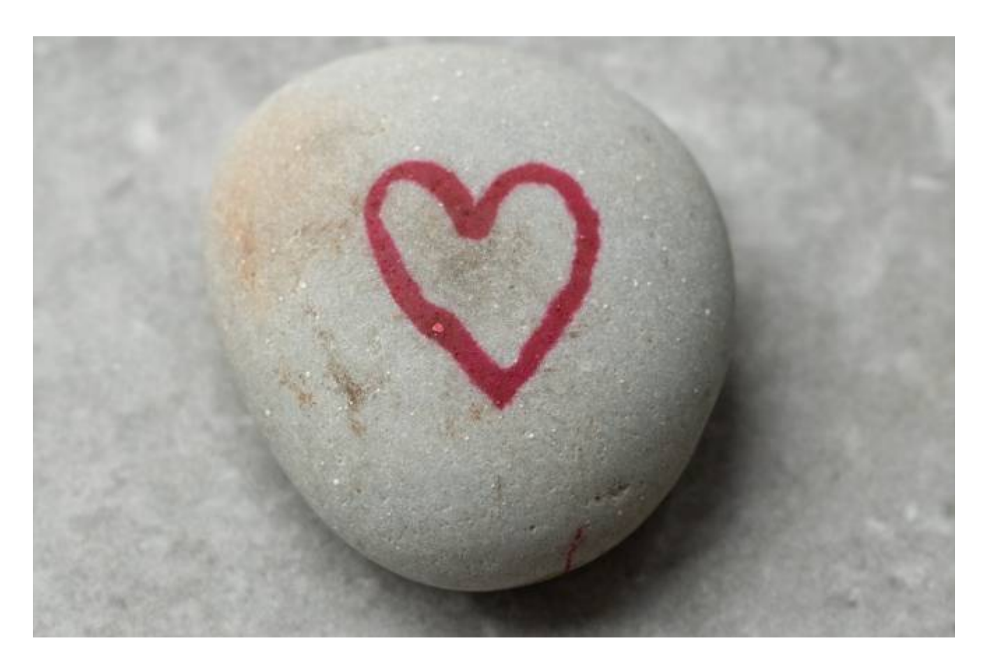
The tough times